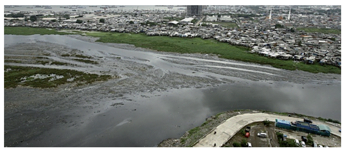
• Pluit Reservoir in danger of overflowing with heavy sediment

invited to talk and discuss with the Governor so that the communication could be active and a two-way process. Citizen engagement was a key component to the success of the project since a major challenge was relocating the people to the new legal subsidized housing.