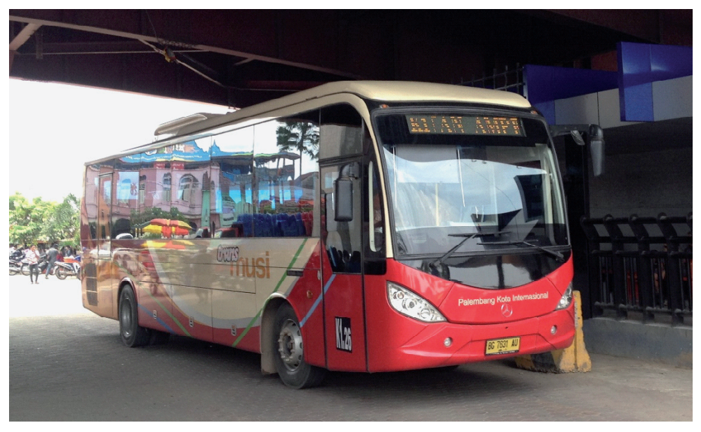
• Palembang Green Urban Transport Project

CDIAsupported the City of Palembang to bridge the gap between the city's transport plan and actual investment in transport infrastructure projects. Activities included a comprehensive sector review and pre-feasibility study with focus on urban transport, infrastructure