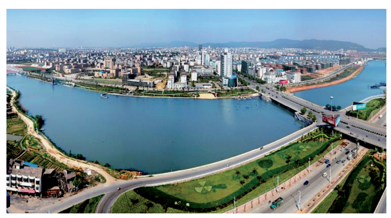
• The Xinyu Kongmu River Flood Control and Environmental Management Project

for up to 3 days in 2010 - the worst flood Xinyu had to face in the modern Chinese period, with the evidence that climate change is beginning to affect the city.